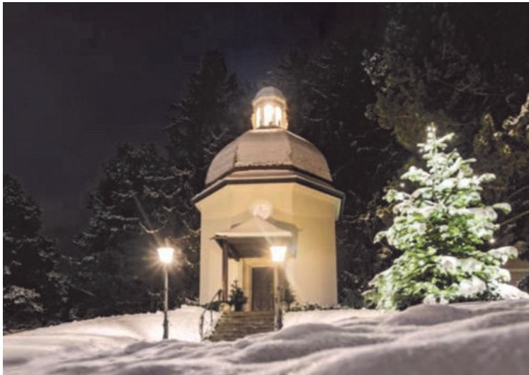
The Silent Night Chapel, which is in the town of Oberndorf in the Austrian state of Salzburg, is a monument to the Christmas carol "Silent Night." The chapel stands on the site of the former St. Nicholas Church, where on Christmas Eve in 1818 the carol was performed for the first time.

(CNS) -- Exactly 200 years ago this Christmas Eve -- Dec. 24, 1818 -- in a little church in what is now Austria, the world heard for the first time a poem set to music that eventually would be hailed as one of the most popular and beloved Christmas carols of all time.