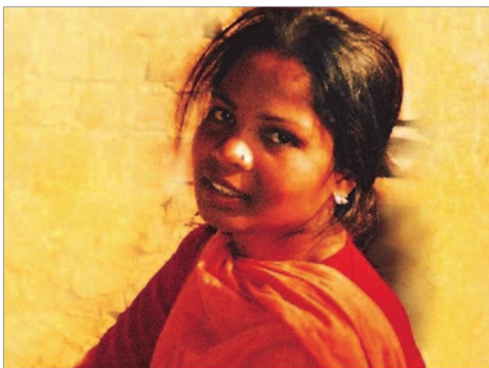
Asia Bibi, the Catholic woman acquitted by Pakistan's Supreme Court after being sentenced to death in 2010 on blasphemy charges, was released on November 7.