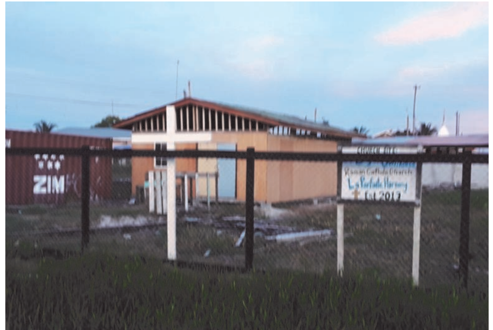
The temporary structure being built at La Parfaite Harmonie for the holding of religious services and other community events.

Once again, our sincere gratitude to those who came from Georgetown parishes, donated items for prizes or snacks, purchased tickets, offered prayers or supported us in any way. Special thanks to Catholic Media and the Catholic Standard for assisting in the promoting of the Bingo, and The Gift Centre, Bounty Farm and Sterling Products for their generous donations. May God richly bless you all.