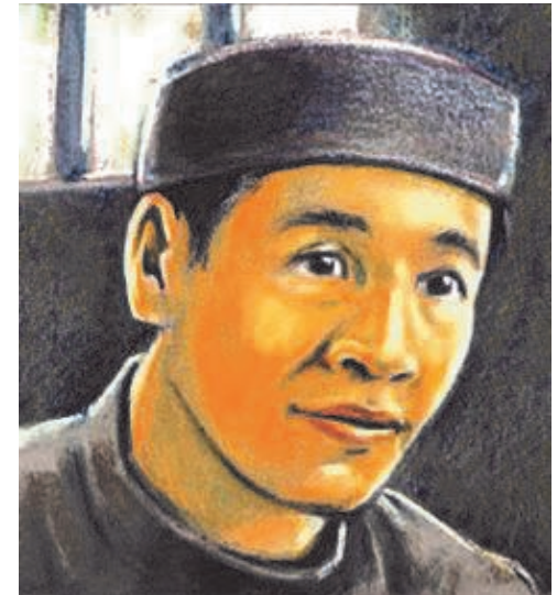
November 24th St. Andrew Dung-Lac & Companions

On June 19, 1988, Pope John Paul II canonized a group of 117 martyrs who died for the Roman Catholic Faith in Vietnam during the nineteenth century. The group was made up of ninety-six Vietnamese, eleven Spaniards, and ten French. Eight of the group were bishops, fifty were priests and fifty-nine were lay Catholics. Some of the priests were Dominicans, others were diocesan priests who belonged to the Paris Mission Society.