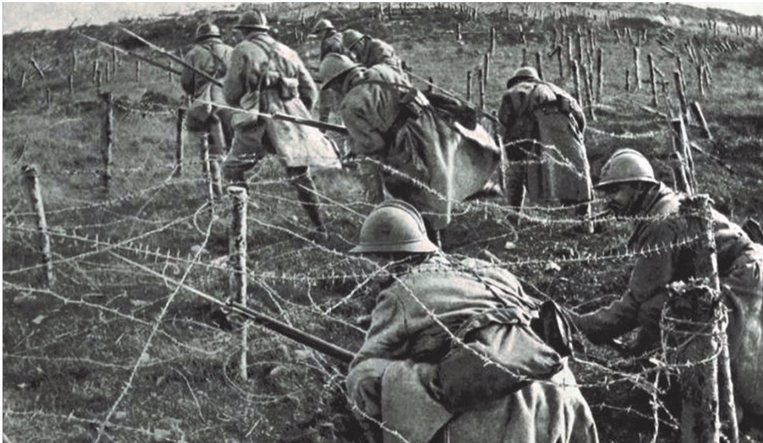
World War I.

(CNA/EWTN News).- The bells of St. Peter's Basilica rang out in unison with thousands of other church bells around the world Sunday as Pope Francis commemorated the 100 year anniversary of the end of World War I. "While we pray for all the victims of that terrible tragedy, let us say forcefully: invest in peace, not on war!" Pope Francis said at the end of his Angelus address Nov. 11.